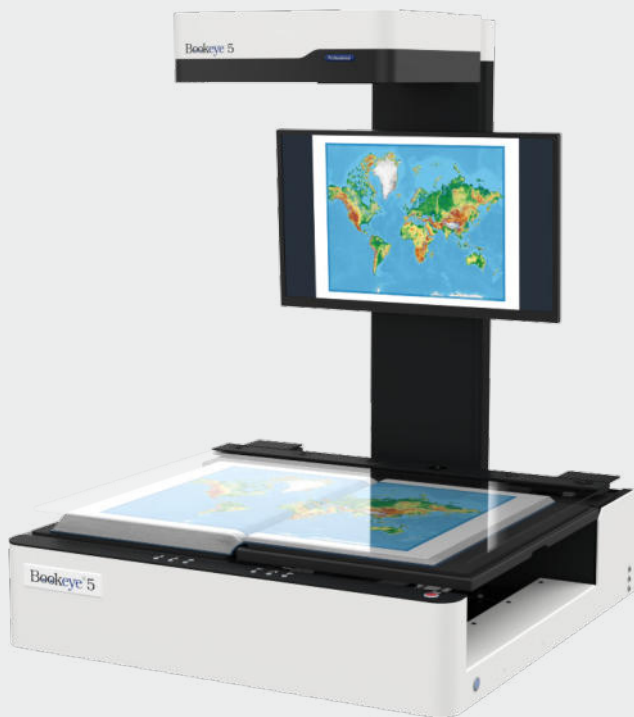
The Bookeye® 5 V1A with V-shaped book cradle and motorized glass plate

Before a new book is scanned, the lift motor lowers the glass plate onto the book until the desired pressure is reached. The pressure is measured highly accurately, and it can be up to 10kg / 22lbs under operator control. Once the book's thickness is programmed into the lift mechanics, the scanner only needs to open and close the scanning glass to allow for book page flipping. The borderless glass plate opens automatically after each scan to the user defined angle. The speed at which the glass plate opens and closes is also user adjustable.